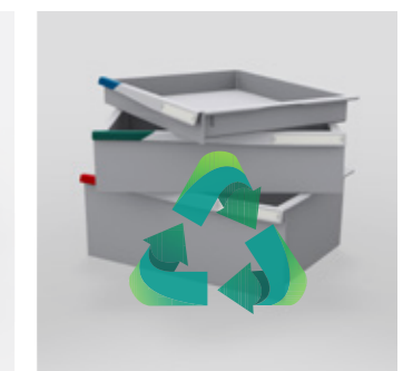
EXPER-mod is made of 100% recyclable injection moulded ABS plastic, and can be washed up to 70°C.