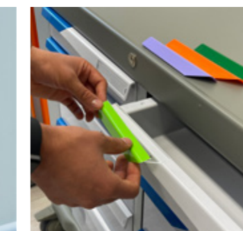
EXPER-mod features easy to change colored ID tags and a handle on the full width.