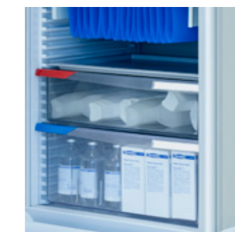
EXPER-mod is also available transparent: all contents are perfectly visible

At FH we transform static drawers into active components of a logistic system: the EXPER-mod is transportable and interchangeable with all our trolleys, shelving systems, logistics columns, cabinets and picking stations.