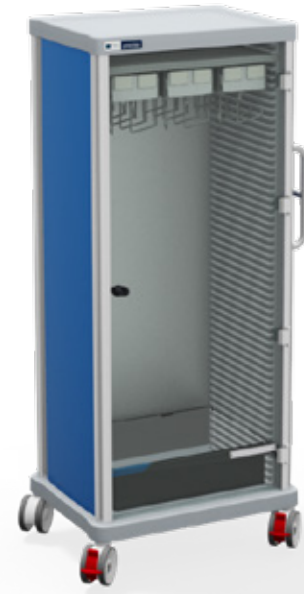
COD.TRS180SAEB-A-CAT PRECISO TRS