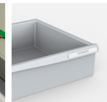
EXPER-mod features a removable label holder with see-through cover and a large paper label.