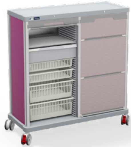
COD.TRS140DAPR-STS PRECISO TRS